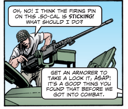
THE QUESTION IS THE SAME NOW AS IT HAS ALWAYS BEEN: WOULD YOU STAKE YOUR LIFE, RIGHT NOW, ON THE CONDITION OF YOUR EQUIPMENT?