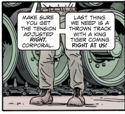
DURING WORLD WAR II, PMCS WAS AN IMPORTANT PART OF EVERY SOLDIER'S DAY. THE ARMY'S CHANGED A LOT SINCE THEN, BUT KEEPING VEHICLES AND EQUIPMENT IN WORKING ORDER HAS ALWAYS BEEN A PRIORITY!