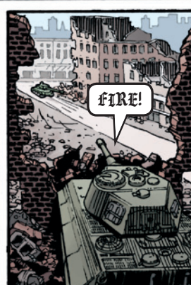
PS 766 31 SEP 16