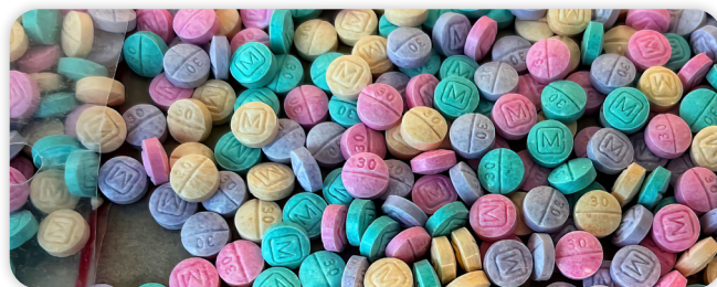
*FAKE rainbow oxycodone M30 tablets containing fentanyl