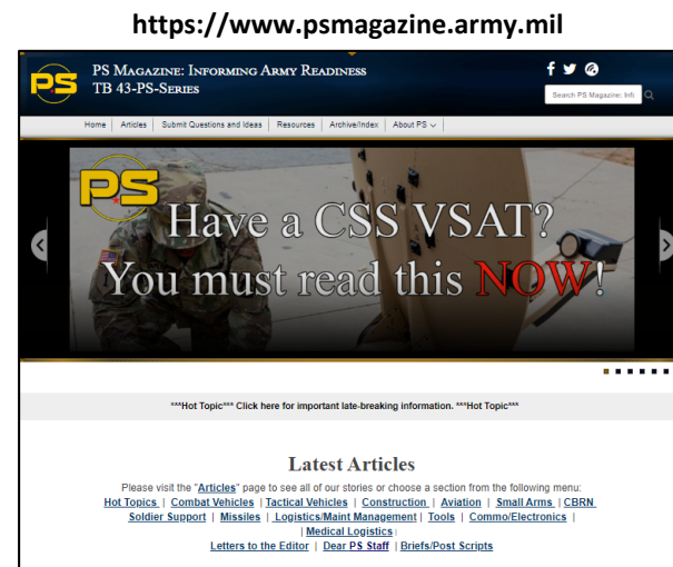
Fully-online, mobile-friendly information portal