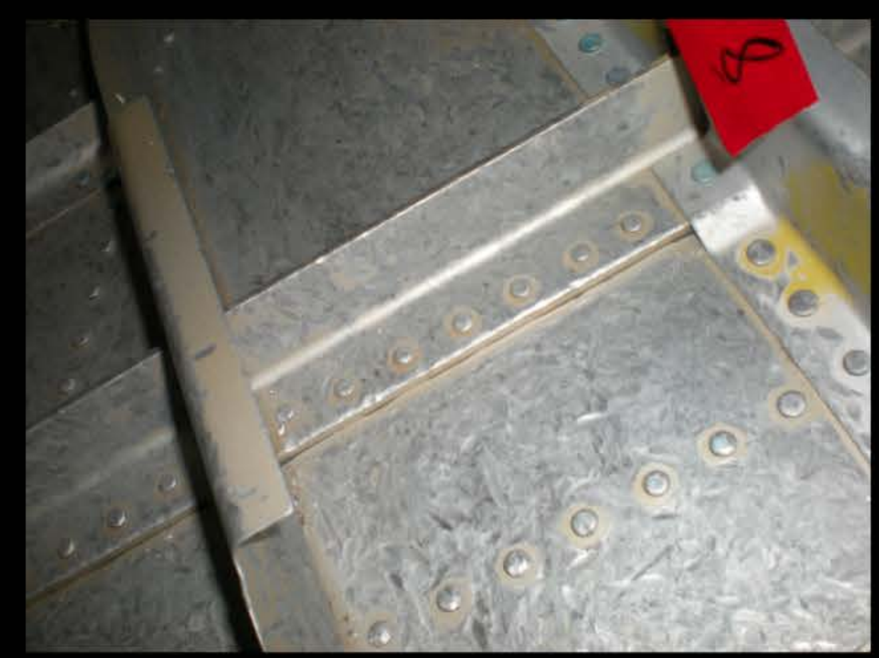
Tie-down chains can damage canted beam area on D-model