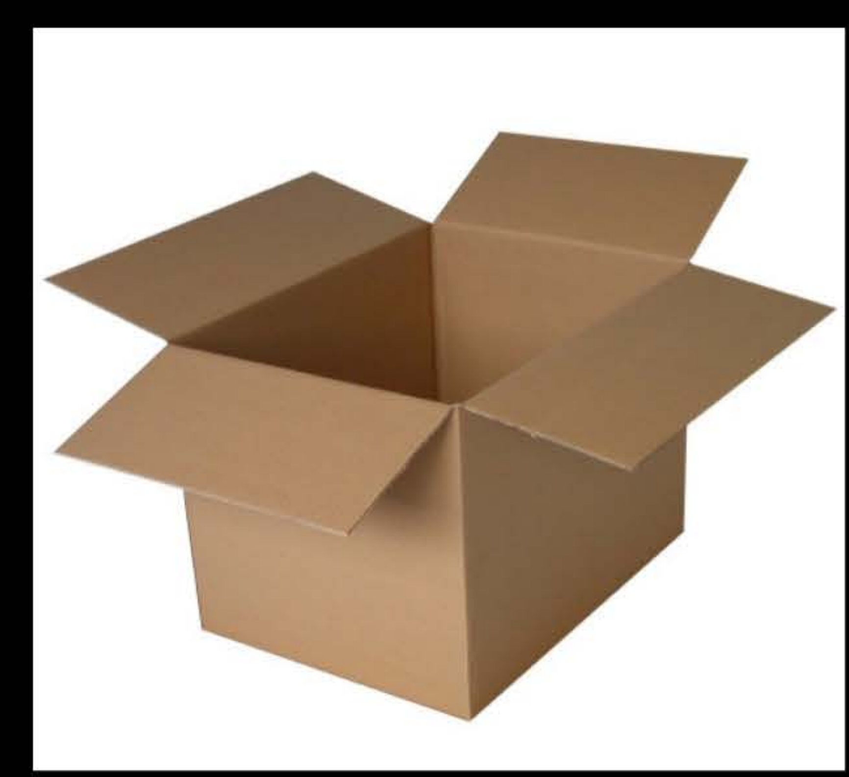
Store chains in a bag or a box inside cabin area